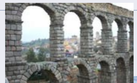
Roman aqueduct, Segovia