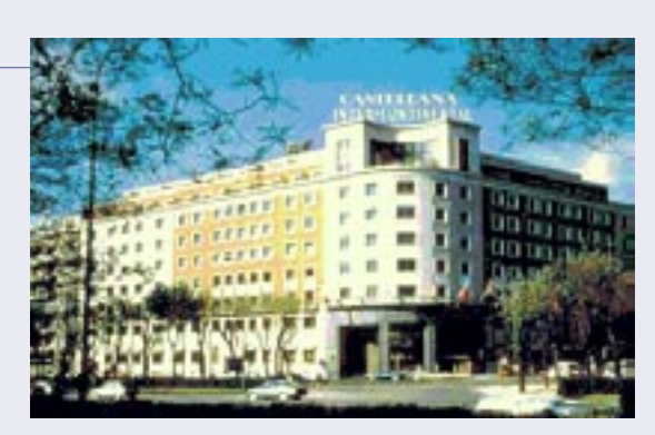
Conference Venue InterContinental Castellana Hotel, Madrid