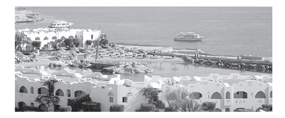
Domina Coral Bay Resort, Sharm-el-Sheik, Egypt

Conference registration details are included in this newsletter. We all look forward to seeing many of our colleagues and meeting new members and colleagues from around the world this fall.